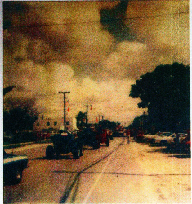
7-4-77 Parade in Bonita