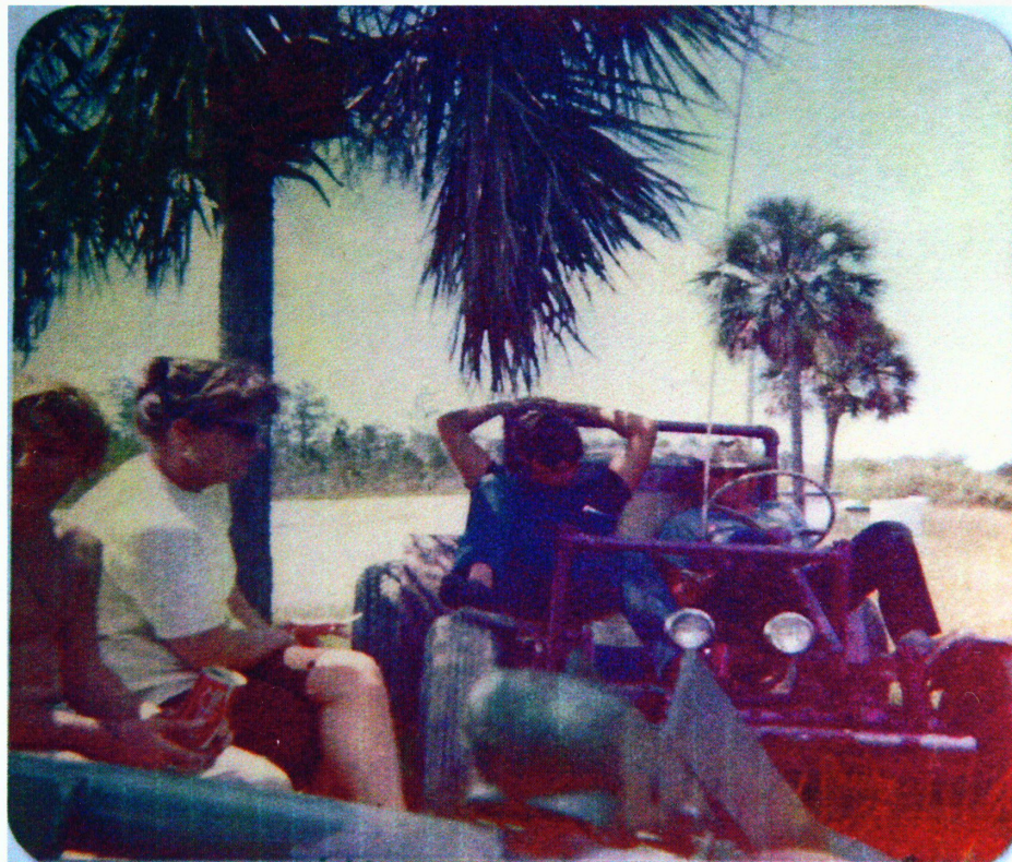
BELOW: Taking a break in the shade